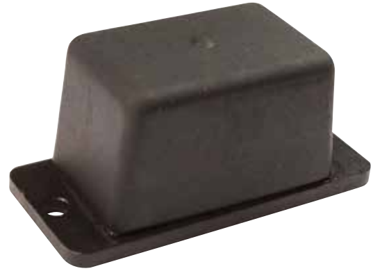
Plate buffers provide a Heavy Duty solution for absorbing high levels of shock and impact forces. The large rubber section allows for high levels of deformation, ensuring that the impact energy is dissipated effectively.